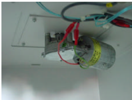
Turntable motor BT16 1860139-SP